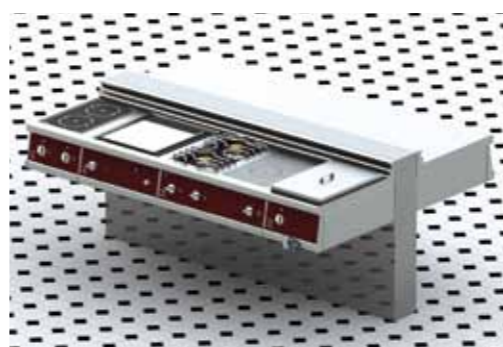
Central island of bridge units suspended on central services wall.